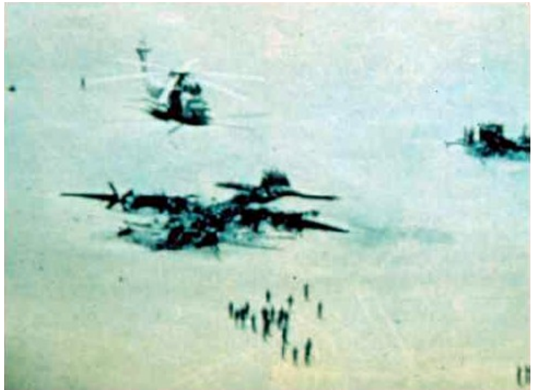
WRECKAGE: OPERATION EAGLE CLAW APRIL 1980